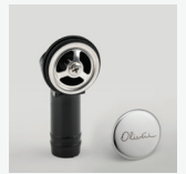
Overflow Round with Cover