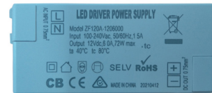
Transformer 12V (Included) 72W low-voltage towel rail transformer