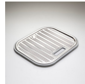
AC73 Utility tray