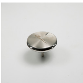
SP28B Basket waste plug