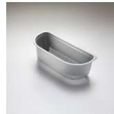
AC74 Bamboo board