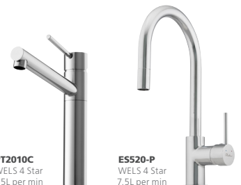
PT2010C WELS 4 Star 7.5L per min