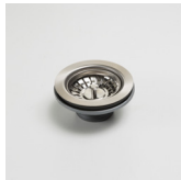
AC05 Basket waste kit for overflow