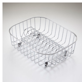
AC71 Drainer Basket